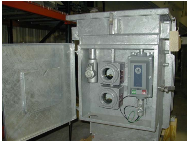
Typical Arrangement Pictured

This Explosion Proof Oil-Cooled Rectifier is equipped with a rugged Tap-Set Adjustment located under the oil. The explosion proof meter housings are located on the side of the rectifier with windows for easy reading of the Voltmeter and Ammeter. Explosion Proof rated power switch and all conduit seals are conveniently located on the side of the cabinet. The conservative design of this rectifier with its Galvanized Steel Enclosure and AC / DC Lightning Arrestors and Surge Protection will result in a long trouble free life.