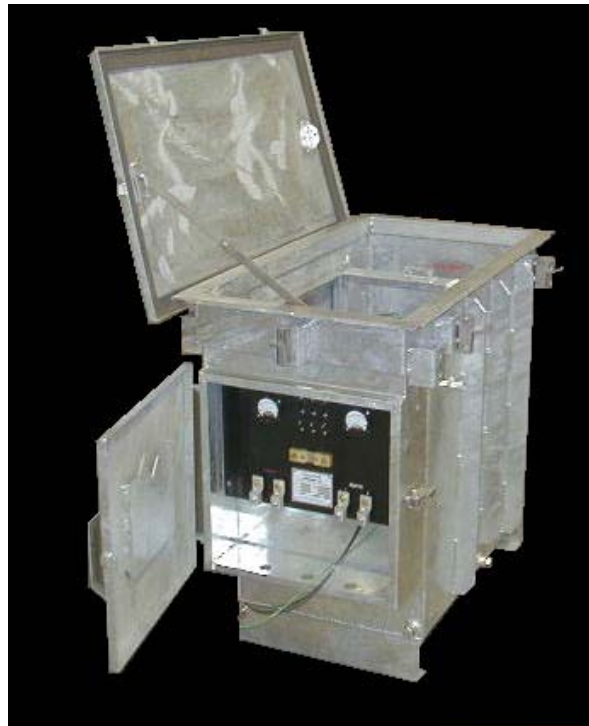
Typical Construction (Explosion Proof Fittings and Other Options see last page)

The Standard Oil-Cooled Rectifier is a heavy duty ruggedized rectifier made of hot dipped galvanized steel. It has external fins for added strength and added cooling. All units are equipped with hinged lid; lid brace and heavy duty draw pull latches as standard features.