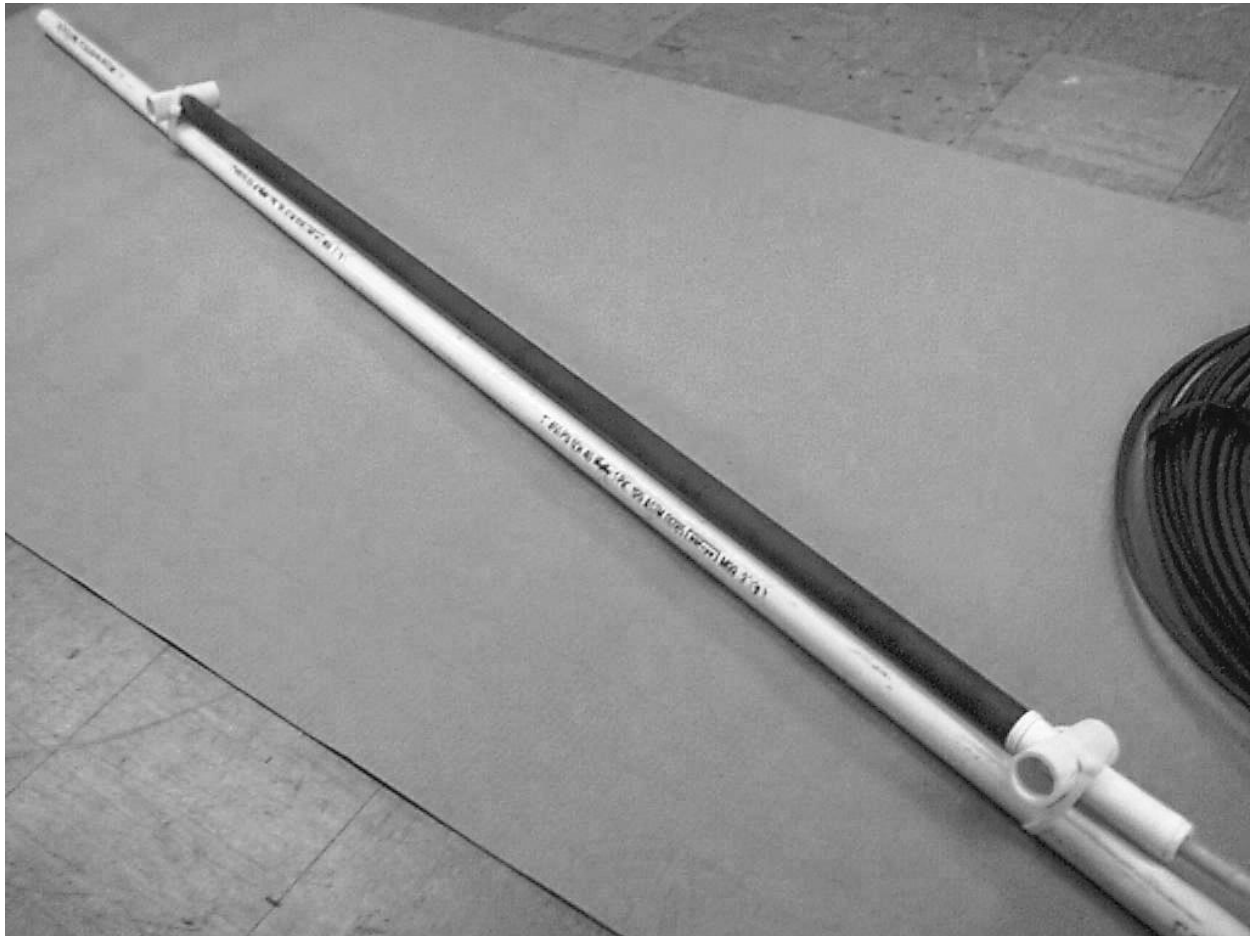
CerAnode CPR-V tubular anode attached to vent pipe